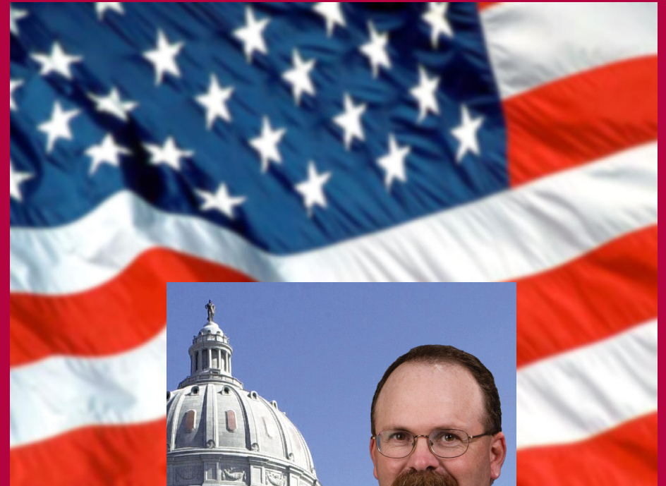
Senator Frank Barnitz